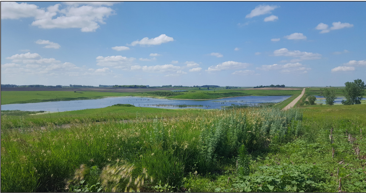
The restored wetland on Steve Snyder's Lincoln County property west of Ivanhoe filled shortly after work was complete. Seen here in summer 2019, it lies within an 80-acre parcel that the previous owner had enrolled in CREP. Today, it's part of a multi-agency, three-landowner project that fixed a 100-year-old ditch system at a fraction of the cost while providing flood mitigation and habitat benefits.