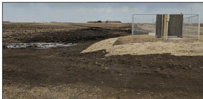
On Stan Gorecki's 60-acre RIM easement, Area II helped to design and install a pump station that lifts water 12 feet from tile that's part of Lincoln County Ditch 37.

Sterzinger described the wetlands today as full of water and fully functional, with the overflow running as designed. Grasses are still dormant at this point, but when the native species mix flourishes, the grasses, shrubs and conifers will provide cover for wildlife.